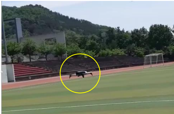
Figure 2. Flight test environment in free obstacle outdoor with Bebop 2.0 quad-rotor

In order to show the effectiveness, the proposed algorithm is tested on physical quad-rotor UAV with real environment. The experiment is executed in outdoor using UAV agent and attacker UAV that represents real scenario as can be seen in Figure 2.